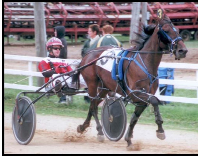
2010 Runner-Up Pacer of the Year Just Win It