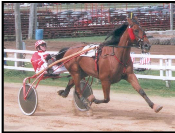
Fox Valley Bunnis 2010 Trotter of the Year

Condition Book 2011 Published by the Wisconsin Harness News