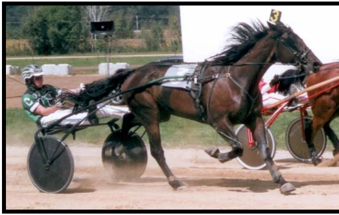
2010 Runner-Up Trotter of the Year Great Getaway