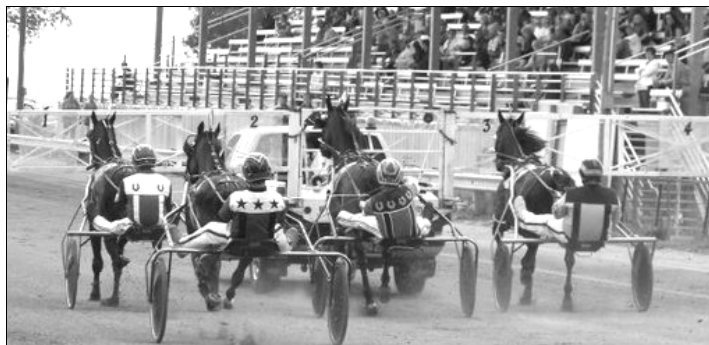
The crowd eagerly awaits a rematch as FFA pacers are tight behind the gate for the second heat in race 4 at Mineral Point.