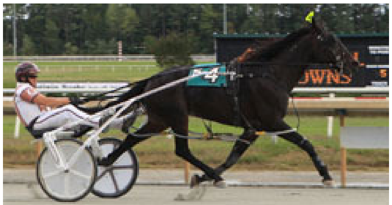
Tattler's Jet lowered his life mark on Tuesday in Virginia.